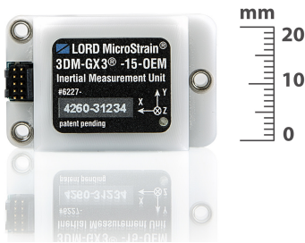
3DM-GX3-15-OEM™ - lower cost, miniature, industrial-grade inertial measurement unit (IMU) and vertical reference unit (VRU) in an OEM form factor

The LORD MicroStrain® 3DM-GX3® family of industrial grade inertial sensors provides a wide range of triaxial inertial measurements and computed attitude and navigation solutions.