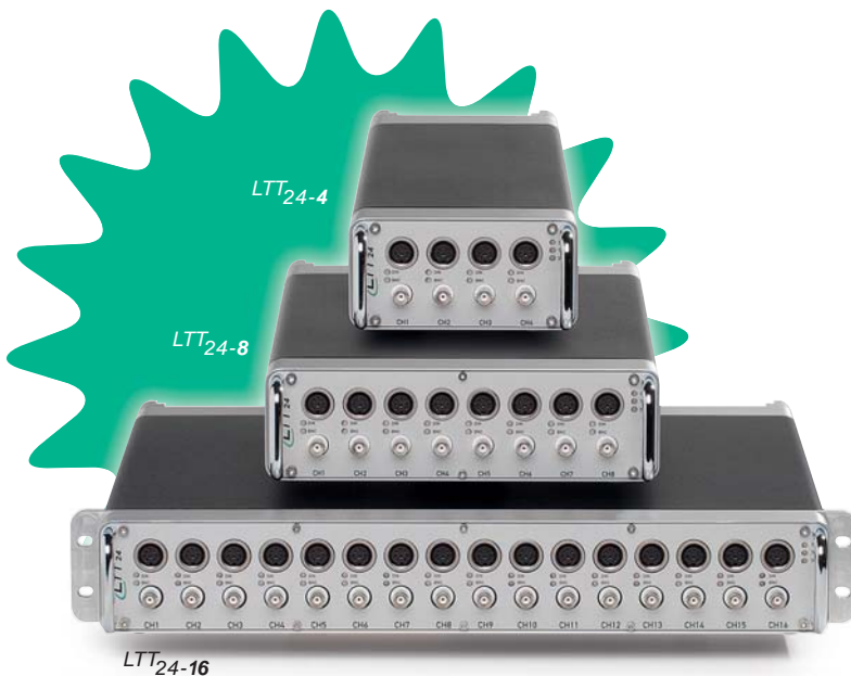
LTT24 - Family