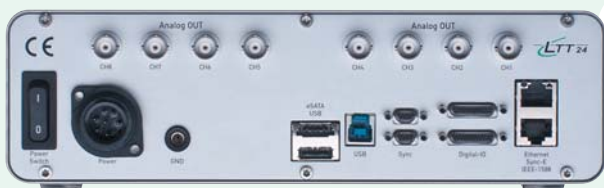
LTT24-8 rear panel