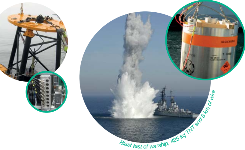
Blast test of warship, 425 kg TNT and 8 km of wire