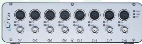
LTT24-8 front panel