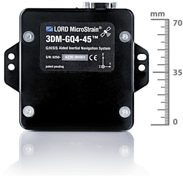
3DM-GQ4-45™ - compact, tactical-grade, all-in-one navigation solution with integrated GNSS and magnetometers, high noise immunity, and exceptional performance

The LORD MicroStrain® family of industrial and tactical grade inertial sensors provides a wide range of triaxial inertial measurements and computed attitude and navigation solutions.